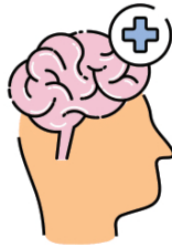
Worsening Mental Health and Limited Access to Care