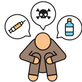
Increase in Farmer and Industry Professional Substance Abuse and Suicide

56,265 farms produced and sold hogs and pigs with 39% of those farms specializing in hog and pig production. Just 47% of all farms selling hogs and pigs reported positive net farm income in 2022, indicating challenging financials, another known stressor, on the remaining 53%. 3